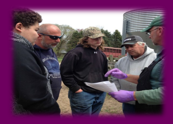
Ogemaw County is home to 280 farms that produce a total of $46m in farm sales annually. Local residents, as well as those statewide, count on MSU Extension for education and guidance.