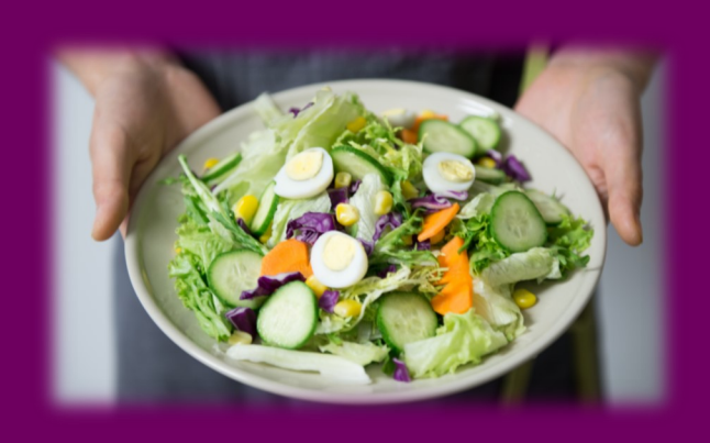
Teen Cuisine classes held in Ogemaw County teach students important skills for eating smart which will stay with them as they grow into adults.