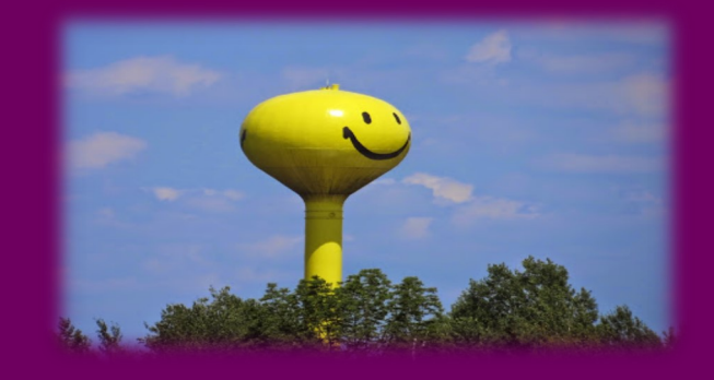
MSU Extension works to teach citizens how to implement best practices in good governance that keeps communities solvent, productive and engaged.