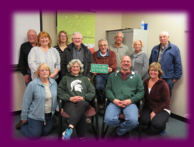
Ogemaw Master Gardeners and Friends welcome new members to their Club following a successful class held at the MSU Extension Office in West Branch last Aug-Nov, 2017