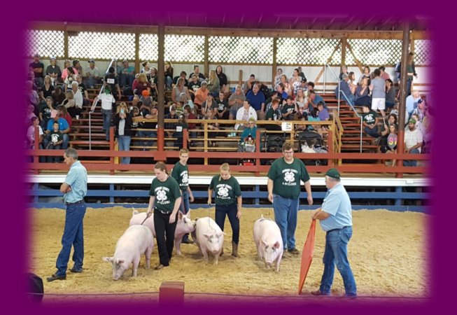
The 2017 Livestock Auction allowed 4-H youth to earn $221,291,50 in animal sales with 127 animals and 120 buyers.